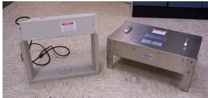
Figures 2-3. UVGI Lamps for Disinfecting Surfaces in Unoccupied Rooms (left) and for Disinfecting Tabletops and/or Floor Surfaces (right)